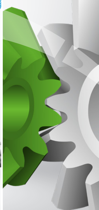
Coniflex Pro for straight bevel gears