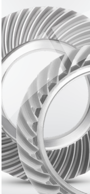
fast, agile production of small bevel gears