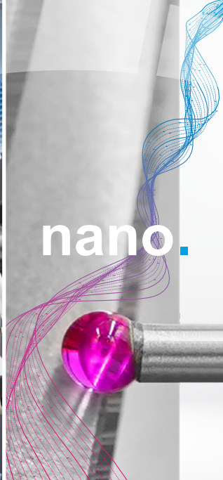
gear inspection at nano level