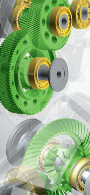
new KISSsoft System Module