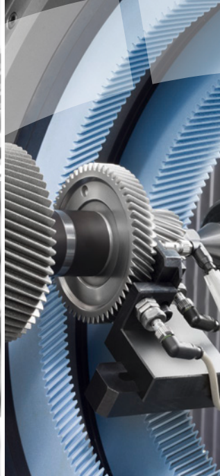
Combi Honing of stepped pinions