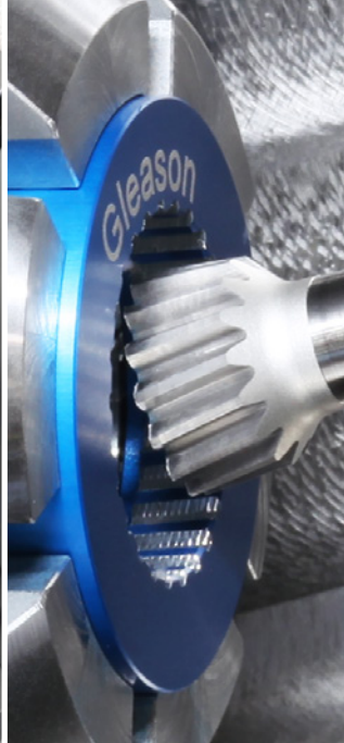
power skiving of robotic parts