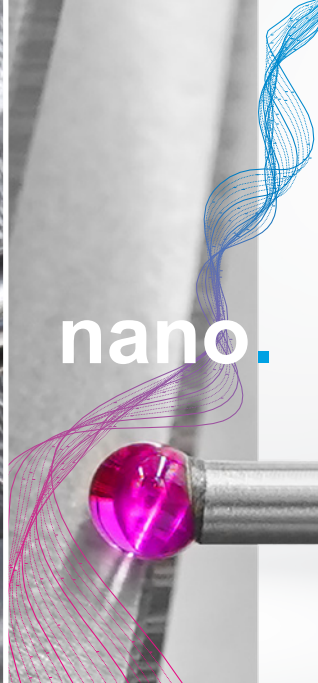
gear inspection at nano level